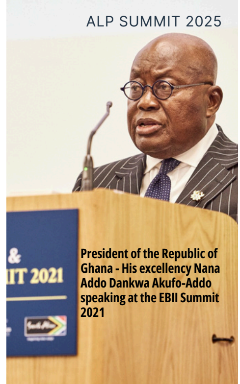
President of the Republic of Ghana - His excellency Nana Addo Dankwa Akufo-Addo speaking at the EBII Summit 2021